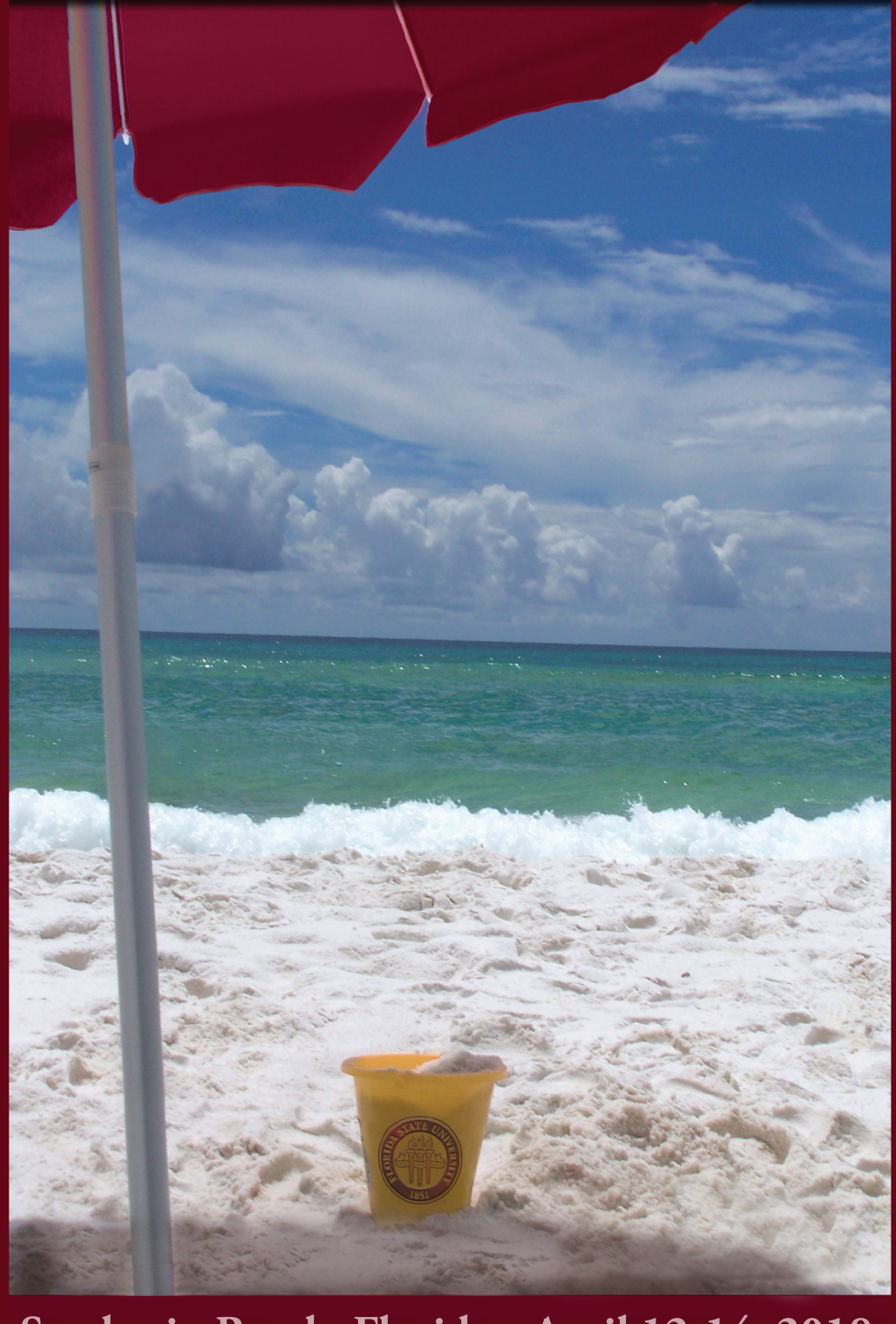
Sandestin Beach, Florida • April 12-14, 2018